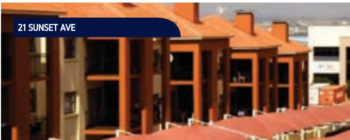
21 SUNSET AVE