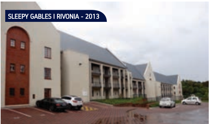
SLEEPY GABLES | RIVONIA - 2013