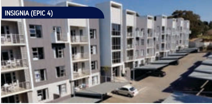
INSIGNIA (EPIC 4)