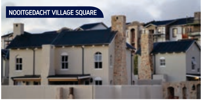
NOOITGEDACHT VILLAGE SQUARE