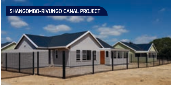
SHANGOMBO-RIVUNGO CANAL PROJECT