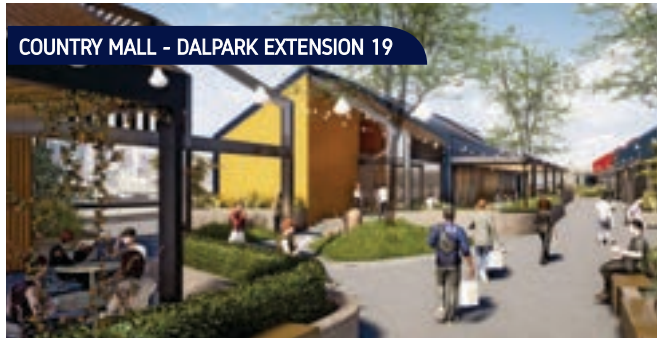
COUNTRY MALL - DALPARK EXTENSION 19