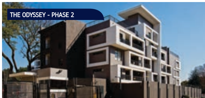
THE ODYSSEY - PHASE 2