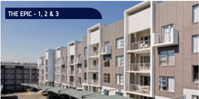
THE EPIC - 1, 2 & 3