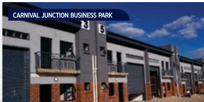
CARNIVAL JUNCTION BUSINESS PARK