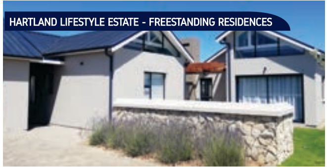
HARTLAND LIFESTYLE ESTATE - FREESTANDING RESIDENCES