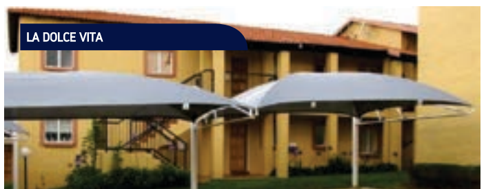
LA DOLCE VITA