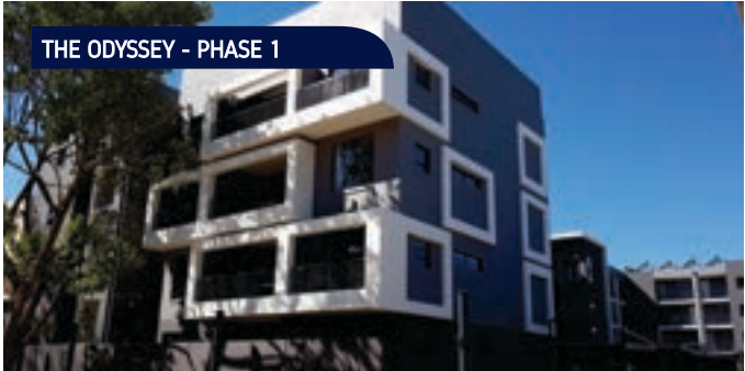
THE ODYSSEY - PHASE 1