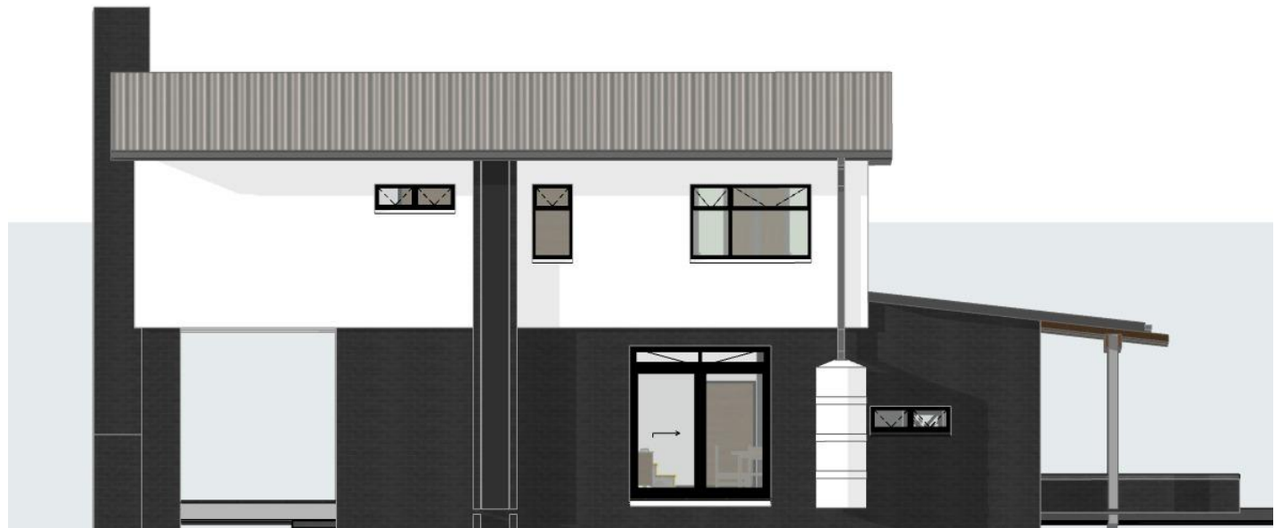
Side Elevation 2