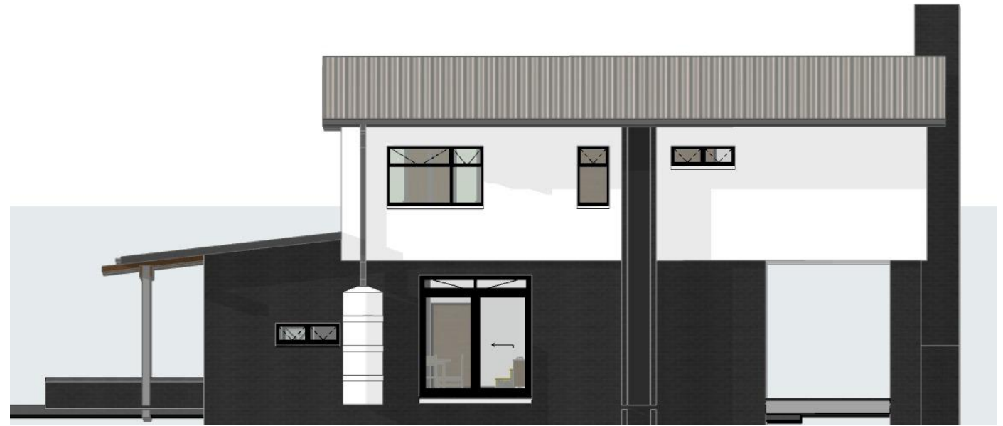
Side Elevation 1